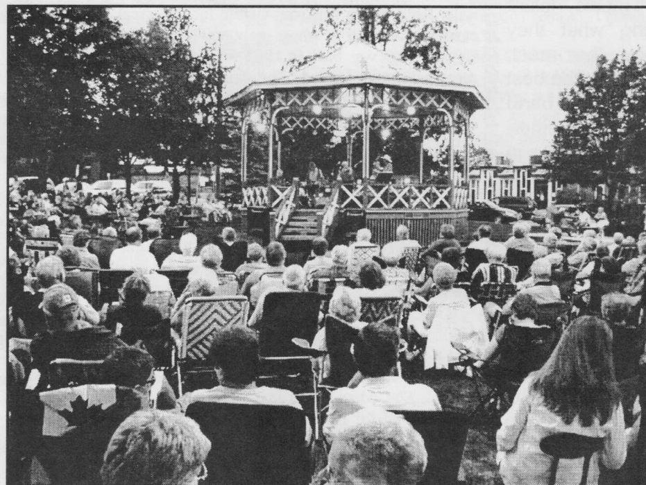
A capacity crowd enjoys the great music at the Bandstand in Gore Park in Elmira.

For anyone who is looking for good traditional country on the radio, try The Golden West Jamboree, every Monday on 100.3 F.M., the Waterloo University FM radio station. From: 12 until 2 p.m.